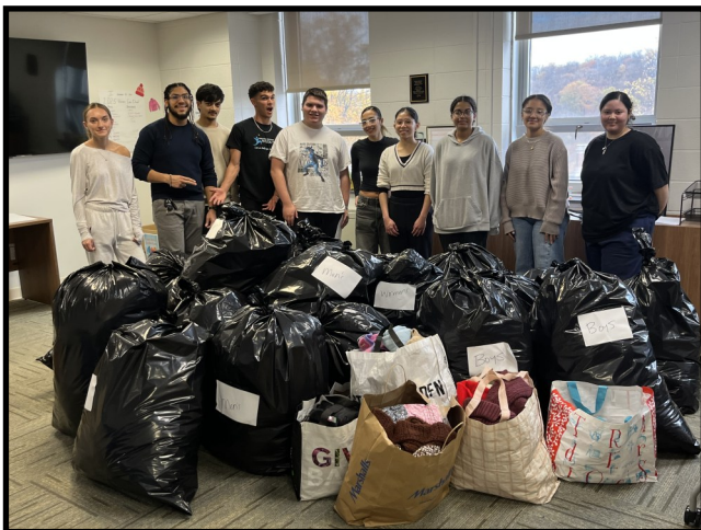
Honors students sorted and bagged coats and other donations.

Thanks to the incredible generosity of our campus community, the 2025 Honors Coat Drive was a tremendous success! This year, Honors collected over 360 coats along with hundreds of scarves, hats, gloves, mittens, and socks, all to be distributed to individuals and families in need through our community partners, Paterson Cares and the Father English Community Center in Paterson.