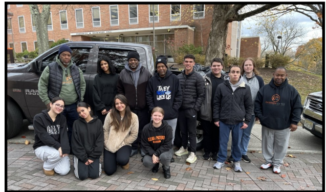
Honors students loaded coat drive donations along with members of the Paterson Cares organization.

The Honors College and Honors Club would like to extend a special thank you to the following individuals and departments for their efforts and assistance in making the Coat Drive successful! In addition, thank you to everyone who donated anonymously at various collections boxes around campus!